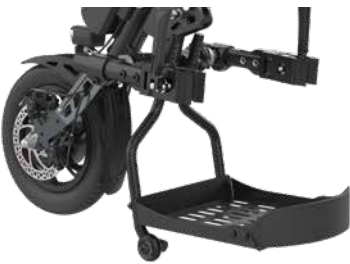
Additional Footrest WCA872620