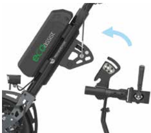
Quick Disconnect Supports easier transportation and storage with a single point disconnection