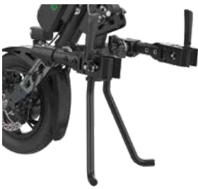
Leg Supports Height adjustable between 260-420mm