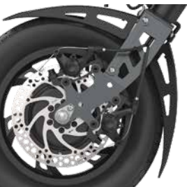
Dual Brake System Mechanical disc and electric braking system

ECO ASSIST is a powered add-on that transforms a manual wheelchair into a motorised mobility aid. Made from aluminium and steel, its lightweight and durable design is easy for users to dock to their wheelchair in seconds. Featuring a robust motor powered by an efficient lithium-ion battery, it's ideal for navigating city streets with ease. With adjustable controls and reliable braking, ECO ASSIST allows users to enjoy everyday journeys with peace of mind.