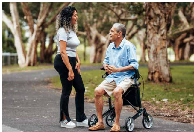
Deep Seat and Wide Backrest For improved comfort and support