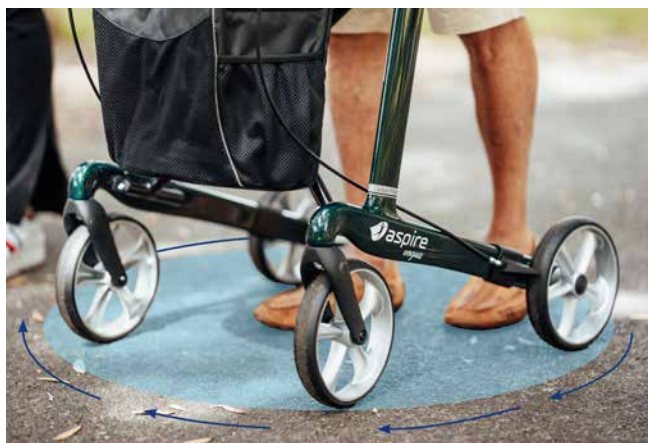
Compact Turning Circle For improved mobility in tight spaces